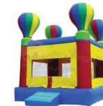
15'x15' 18' tall