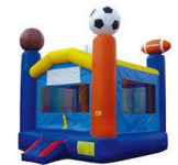
15'x15' 15' tall