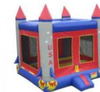
15' x 15' 15' tall