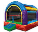
10'x13' 10' tall